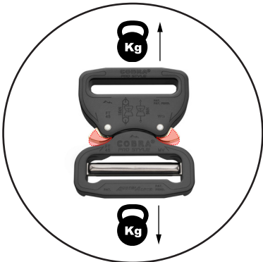
NO RELEASE UNDER TENSION