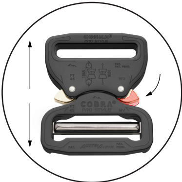
NO ONE-SIDED RELEASE