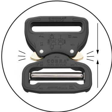
ACOUSTICALLY CONFIRMED LOCKING