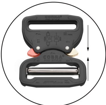
NO ONE-SIDED LOCKING